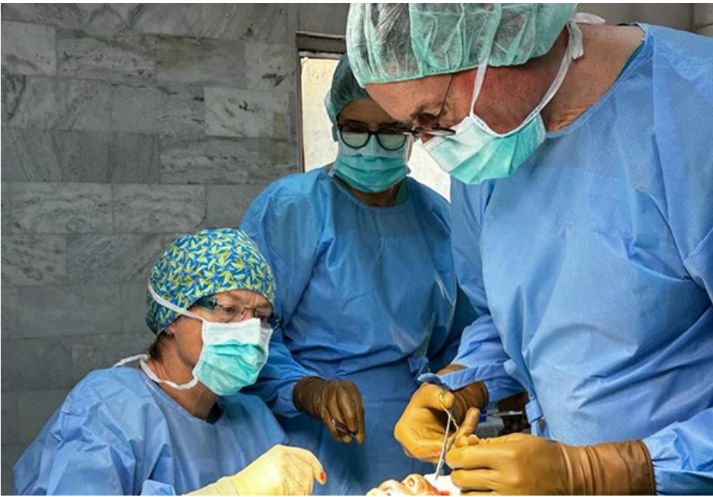
Surgeons work on a burn patient.

I joined the Rotary Club of Ranipur in 1987 with a simple idea in mind: to do something meaningful for our community of Haridwar. Little did I know that my simple idea would blossom into something truly life-changing.