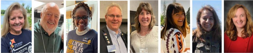
Pictured above: Keystone Rotary Board of Directors

Reach out to us at KeystoneRotaryConnects@gmail.com