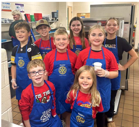
Meet our "Rotarians in Training!"

The Zelenople Club had a busy November. First, we toured the brand new Zelenople location for our local fire station. We held a pancake breakfast fundraiser to benefit the Hope Squad, a suicide prevention program at the Seneca Valley School District. We also: collected socks for the New Castle City Mission; ran a Lottery Calendar fundraiser; hosted a District Governor Official Visit Dinner for the Rotary Clubs of Ellwood City, New Castle and New Wilmington; and, hosted the annual Christmas Tree Lighting in conjunction with Small Business Saturday in Zelenople.