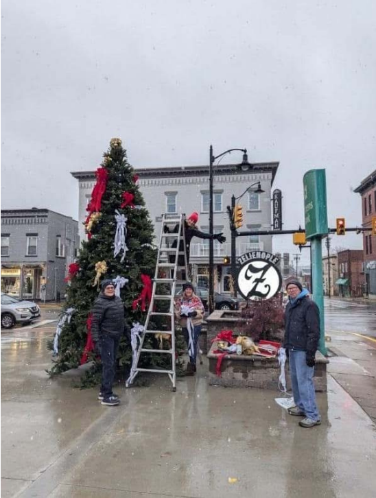
Zelienople Rotarians decorate the Main Street Christmas Tree. The Rotary helped donate the tree and take responsibility for setting it up each year.