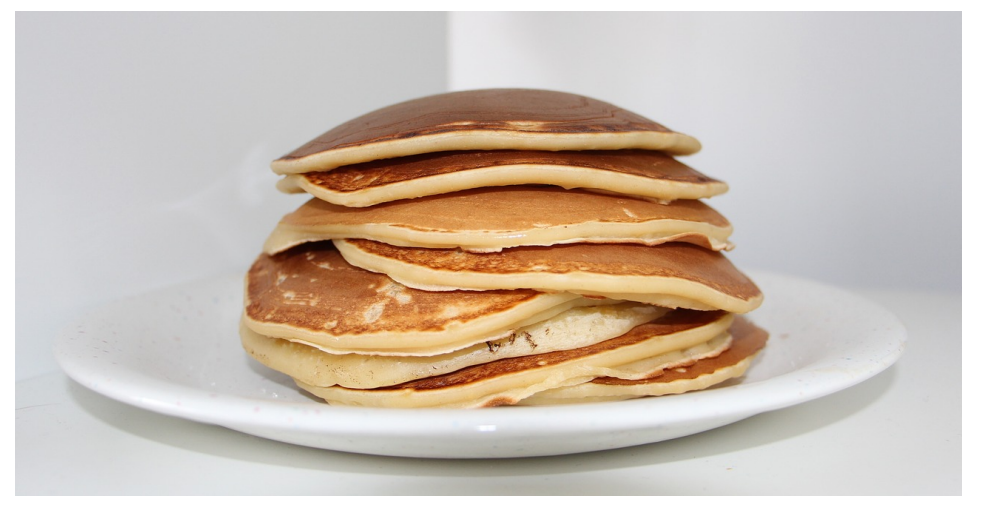
Request for volunteers to sign up will be coming soon.