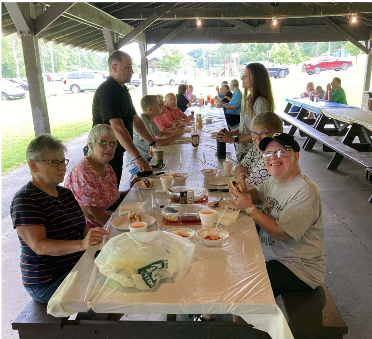
More Happy Diners