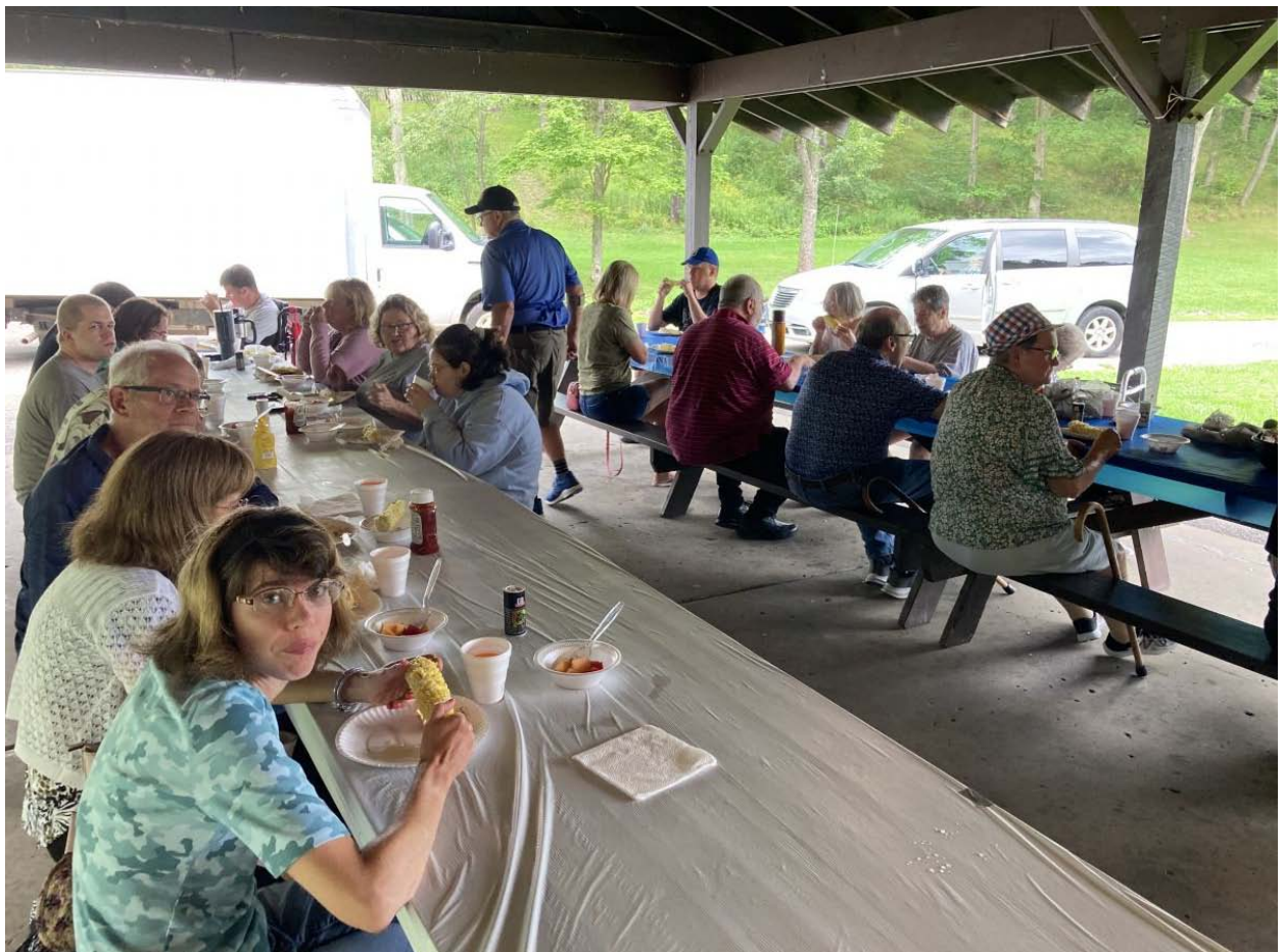
Early Butler Arc Diners Enjoying The Meal