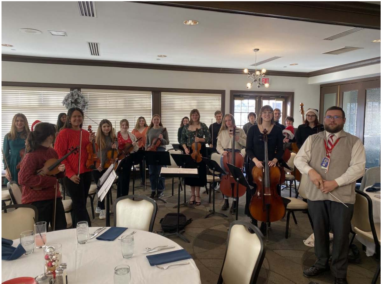
Rich-Mar Warm Clothing Drive 2022