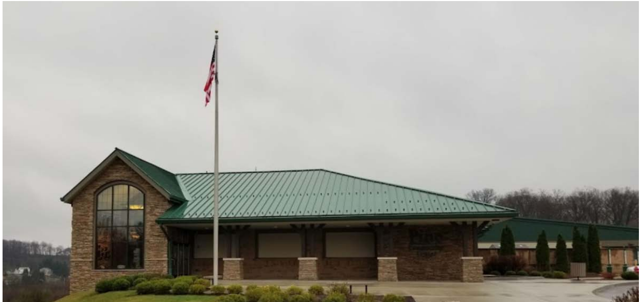
Pine Community Center 100 Pine Park Dr, Wexford, PA 15090