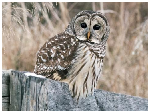
Barred owl, only owl with brown eyes

Some of the exciting sightings include Kirtland's warblers in Michigan, Venabygd, Norway for a barred owl, ( We have them here in New York state) Sundarbans for Kingfishers of all kinds, ruby throated hummingbirds, birds of paradise (Papua, New Guinea), and penguin colonies in Antarctica.