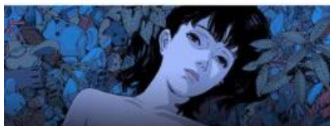
Perfect Blue (1997)