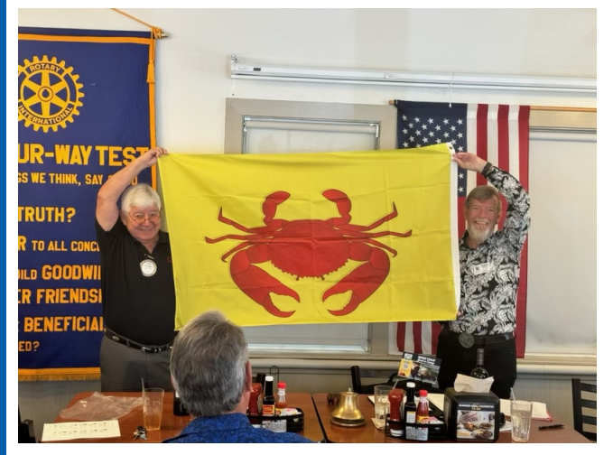
CLUB ACTIVITY - TBD Weather Permitting.