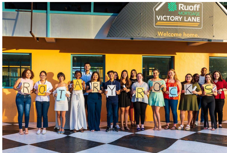
Rotary Scholarship winners at Racetrack ceremony June 15, 2022.

Target opens Nov. 6. Raising Cane chicken franchise opens Nov. 8. Holiday event will be huge this year at the Park - Dec. 9 for the traditional Tree Lighting ceremony.