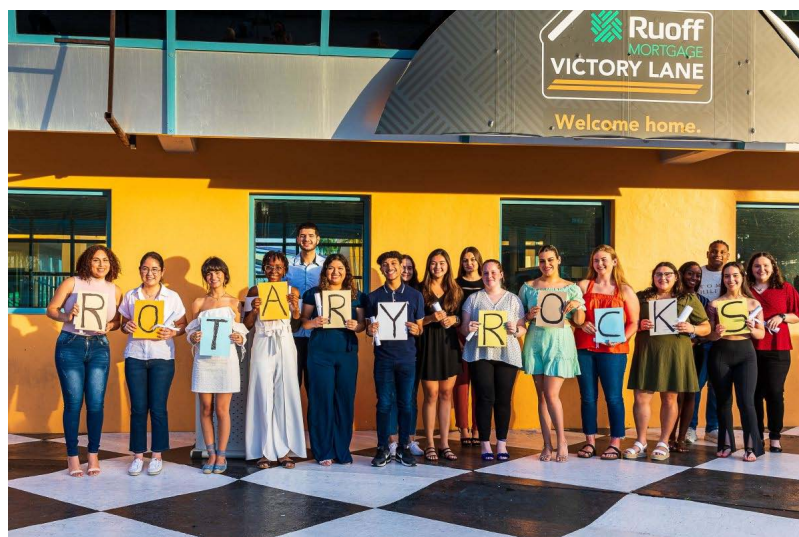
Rotary Scholarship winners at Racetrack ceremony June 15, 2022.

Target opens Nov. 6. Raising Cane chicken franchise opens Nov. 8. Holiday event will be huge this year at the Park - Dec. 9 for the traditional Tree Lighting ceremony.