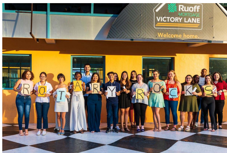
Rotary Scholarship winners at Racetrack ceremony June 15, 2022.