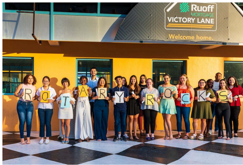
Rotary Scholarship winners at Racetrack ceremony June 15, 2022.