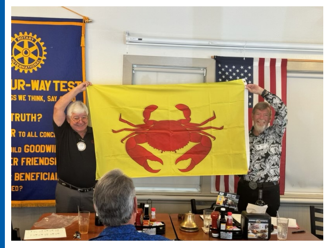
CLUB ACTIVITY - Coastal Clean up - September, day to be determined.