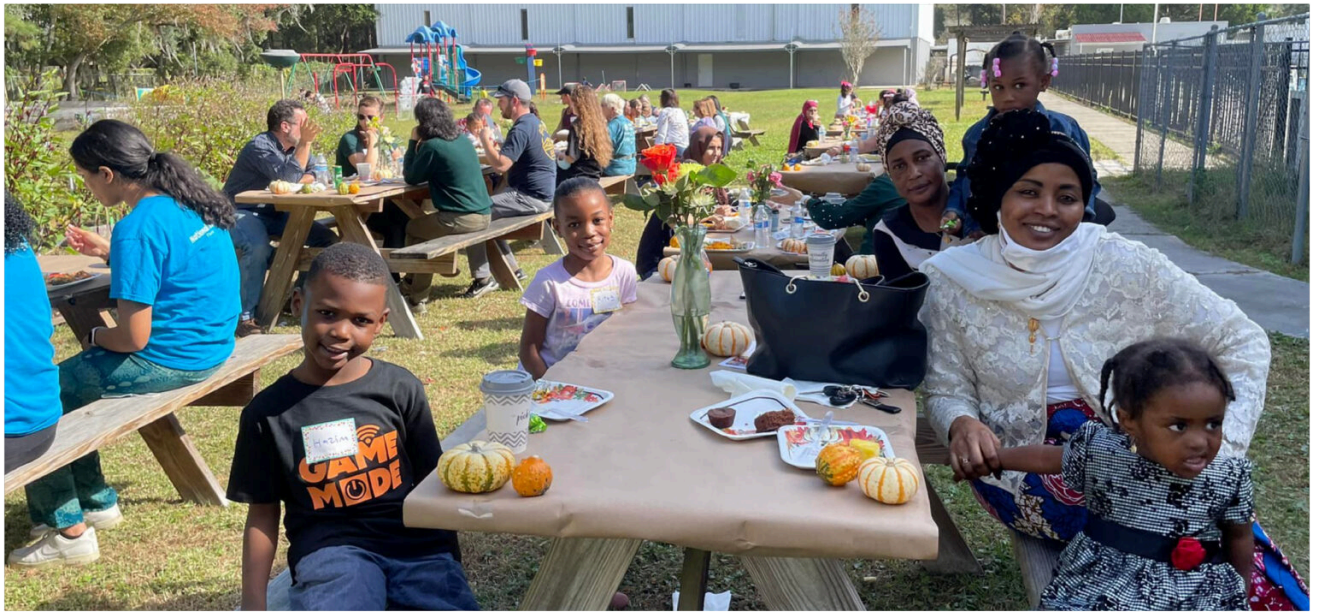
Some of the people helped by the YMCA's New American Welcome Center.

The Rotary Club of Ponte Vedra at Nocatee is continuing its enthusiastic support of the YMCA New American Welcome Center (NAWC) with a Spring Clothing Drive. For those new to our Rotary Club, the NAWC (7373 Old Kings Road South in Jacksonville) helps immigrants make the challenging transition into American society. This is a prelude to their becoming fully contributing new American citizens. Our club has already made generous contributions to NAWC through their Oates Community Food Pantry. The new Spring Clothing Drive will nurture and strengthen our Club's relationship with them further.