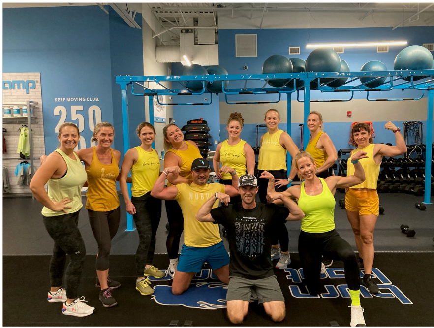
Burn Boot Camp members and trainers wear yellow to support Rubber Duck Race week.