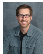
Public Relations Chair