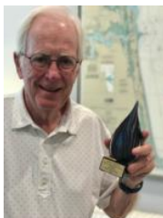
Community Service Chair