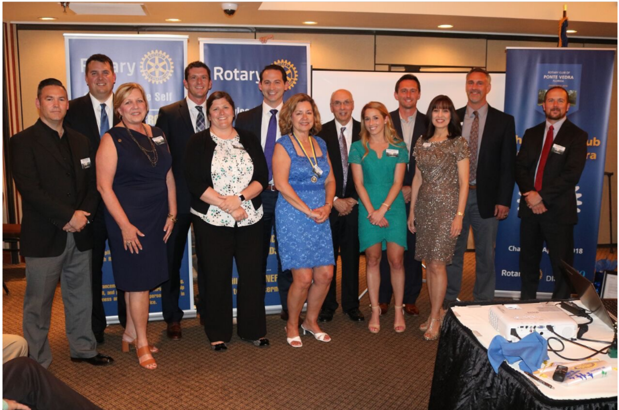
The Charter Board of Directors for our Club, April 2018.

On April 2, the Rotary Club of Ponte Vedra will celebrate its 5th anniversary. Since its inception in 2018, the Rotary Club of Ponte Vedra has grown to about 30 members and has given over $100,000 in donations to charitable efforts as well as volunteered thousands of hours to our community through planning meetings, committee meetings and hands-on service.