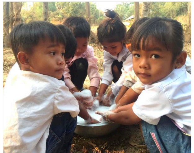
School children in Cambodia wash their hands in one of the clean water projects already administered by the Rotary Clubs of Pursat and Gainesville.

Club leaders will share updates on this Global Grant process as they become available.