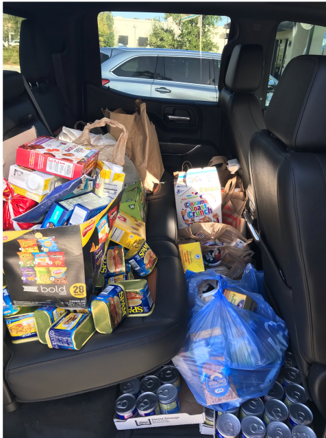
Donation collection from November 8

4000 local families are served every week by the St. Johns Food Pantry. That's why we've dedicated the month of November to collecting donations for them. You can help our effort in a variety of ways.