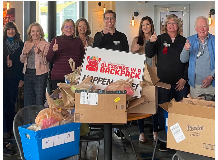
Club members gather around their donations for last year's Blessings in a Backpack

Once again our amazing Rotary Club is coming to the aid of kids in our community through “Blessings in A Backpack”. “Blessings in a Backpack” provides food for school aged children on the weekends and during holiday breaks in our community that experience food insecurity. Over 9 million children in the US experience food insecurity, that’s one in every 8 American children.