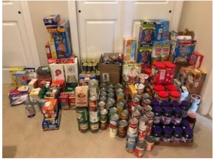
Donation collection from November 15