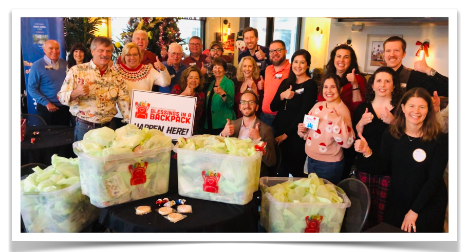
Club members give a thumbs up after completing this year's Blessings in a Backpack event.

Thank you all who helped packed food at our holiday party for Blessings in a Backpack. This year we packed 125 bags of food for Crookshank Elementary School in St. Augustine. This