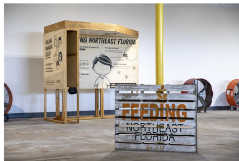
Signage and a display inside Feeding Northeast Florida's new warehouse. Feeding Northeast Florida