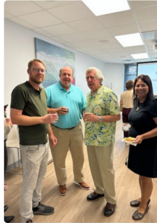
Volunteers In Medicine Social