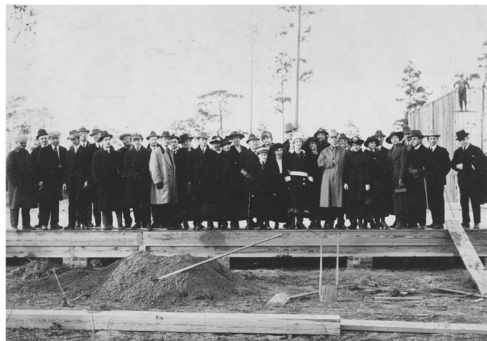
Founders Eagle Film City/Norman Studio

Founders of Eagle Film City, predecessor to the Norman Studios, 1916