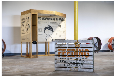
Signage and a display inside Feeding Northeast Florida's new warehouse. Feeding Northeast Florida

5245 Old Kings Rd, Jacksonville, FL 32254