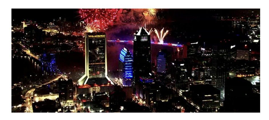
### A Spectacular July 4th Celebration in Jacksonville, FL

**The sun rose on Jacksonville on July 4, 2024, with the promise of a day filled with patriotism, joy, and celebration. The city's skyline, framed by the St. Johns River, gleamed under a bright summer sky, setting the perfect stage for a series of events that would bring the community together in a shared sense of pride and festivity.**