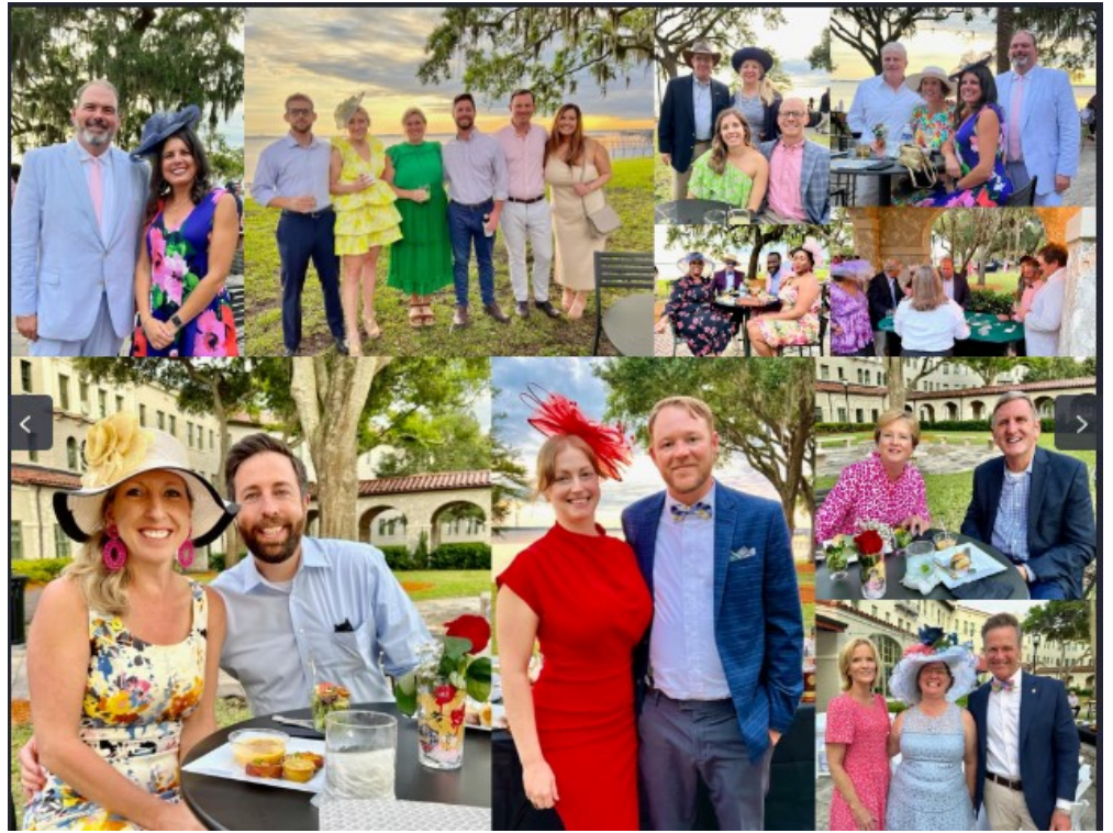
Fun times from the 2023 Derby Gala.