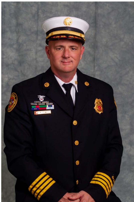
Keith Powers, JFRD Fire Chief

Keith Powers leads the Jacksonville Fire and Rescue Department, an organization with more than 1,500 uniformed personnel, 61 fire and rescue stations and a budget of approximately $303 million.