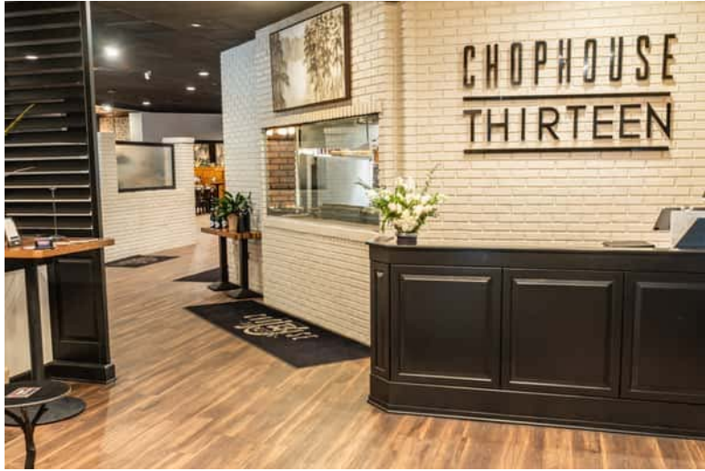
Chophouse Thirteen Location: 11362 San Jose Boulevard Jacksonville, FL 32223