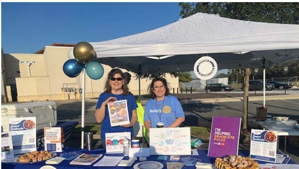
This past weekend, the 4th annual International Car Show at Butler Plaza delighted car enthusiasts while supporting a great cause. As this year's