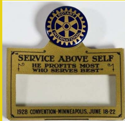
A name badge from the 1928 Rotary International Convention features Rotary's mottoes.