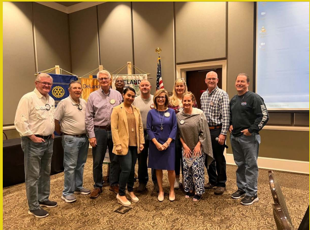
Rotarians wearing blue to support International Childhood Abuse Awareness Month