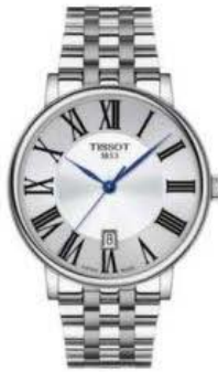
Tango Raymond Weil wristwatch Value $950