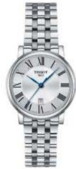
Carson Tissot wristwatch Value $340