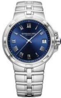
Parasifal Raymond Weil wristwatch Value $1,450