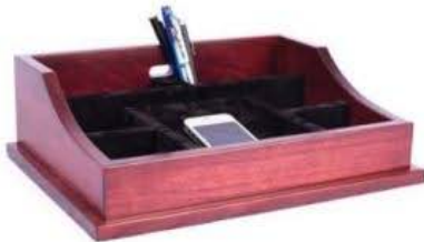
American Chest Cherry Wood Valet Chest, Value $295