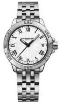
Carson Tissot wristwatch Value $375