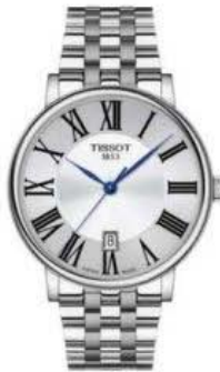
Tango Raymond Weil wristwatch Value $950