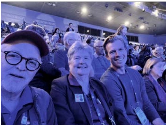
At Tuesday night's "Streets of Melbourne" event, your District Governor Group was joined by an impromptu group of Dutch Rotarians.