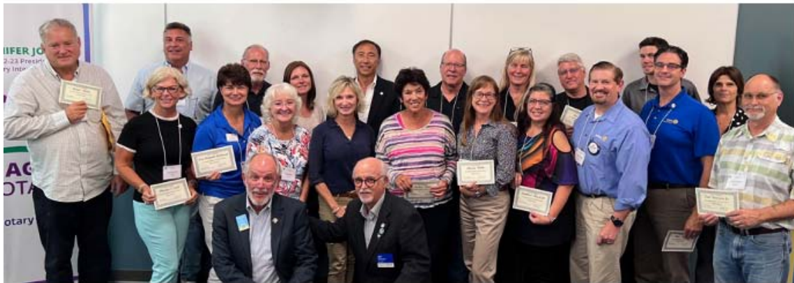
RLI Part 3—Graduates. Saturday August 6, 2022, Daytona Beach State College—Palm Coast