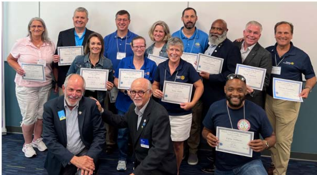
RLI Graduate Class. Saturday August 6, 2022, Daytona Beach State College—Palm Coast