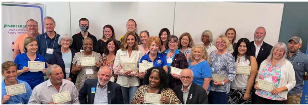
RLI Part 2. Saturday August 6, 2022, Daytona Beach State College—Palm Coast