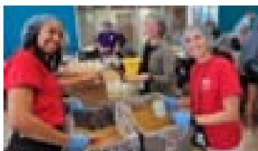
RYLA mentors and Rotary club presidents alike actively participated.