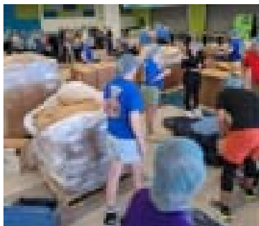
Interactors from throughout the district were involved in all phases of the food pack.