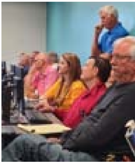
Rotarians were hard at work listening about how to complete a successful district grant.