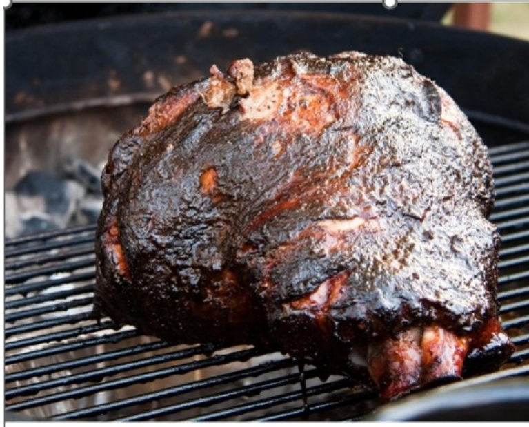
Pork butt success