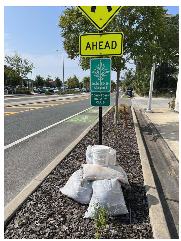
And a BIG THANKS to the SF Rotaractors!