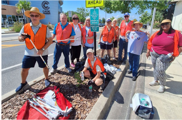
Hard working crew made up of Rotarians and Gainesville Opportunity club members!!