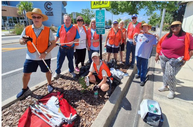
Hard working crew made up of Rotarians and Gainesville Opportunity club members!!