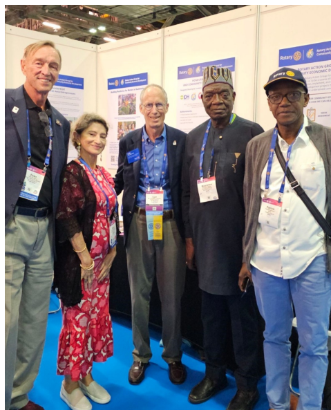
Head of the Community Development Action Group and more new friends