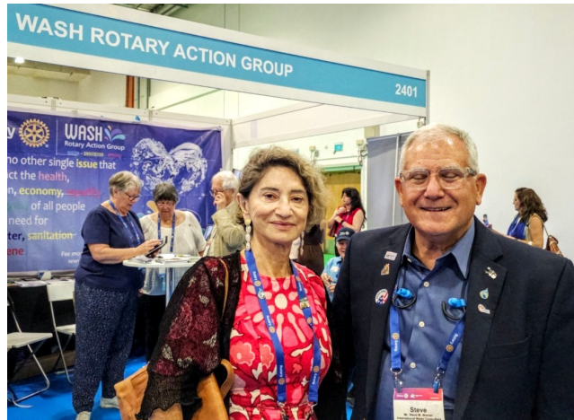
WASH consultant from Colorado