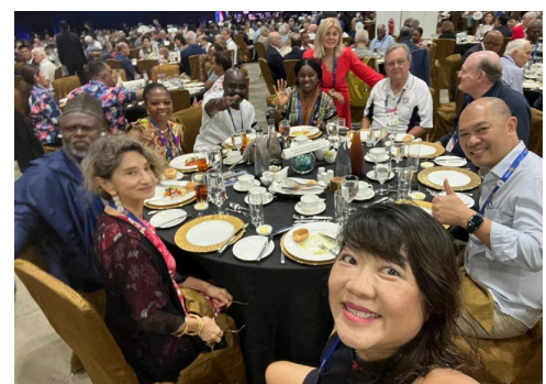
New friends and Fellow Rotarians from around the world.