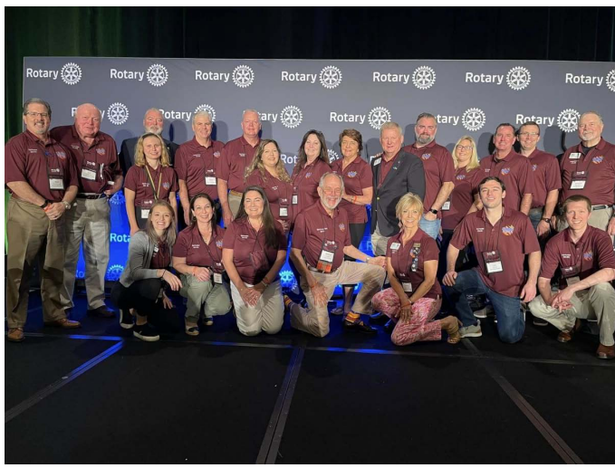
Our District 6970 President Elects and Area Governors for 2023-24 There are 12 areas within District 6970. Our club is Area 1 within the District.