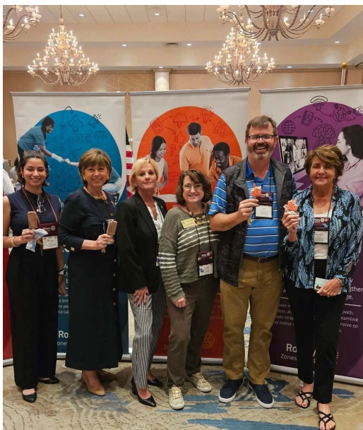
rewarded with ice cream