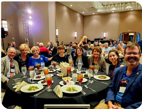
Dinners were times for speakers and fellowship