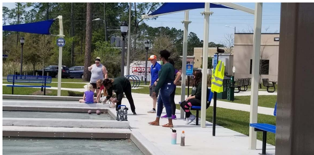
Everybody having fun!