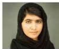
Malala Yousafzai Nobel Prize Winning Activist Rotary Club of Sault, Pakistan

Malala Yousafzai is a Pakistani activist for the right of women and girls to have access to education.