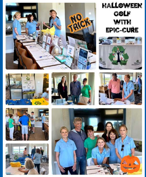
SWAG-ing a golf tournament!