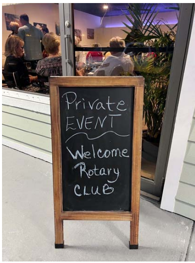
Rotary had the entire restaurant at Purple Olive. Lots of familiar faces!