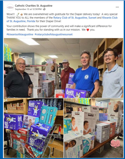
Team Sunset made a significant donation of diapers ($600+) to Catholic Charities of St. Augustine! Thank you to all who participated and helped families with young children in our community with your donations.