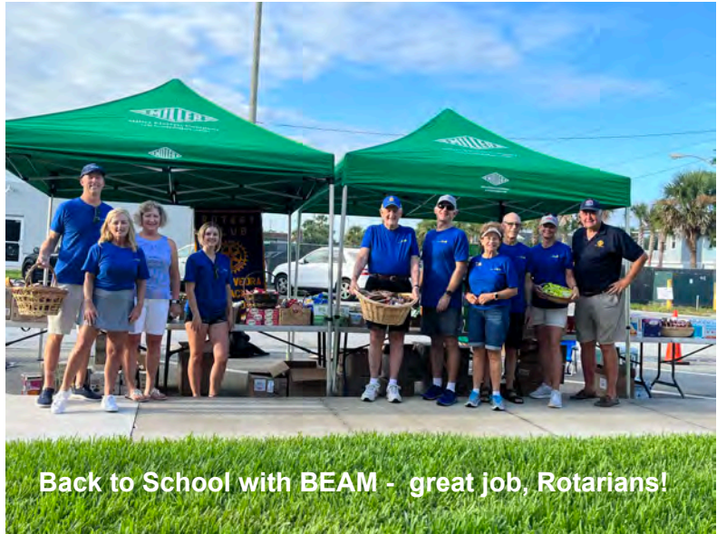
Back to School with BEAM - great job, Rotarians!