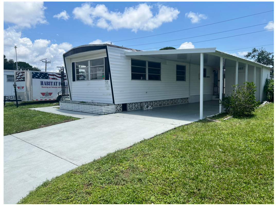
Unit 71 after the carport was installed.