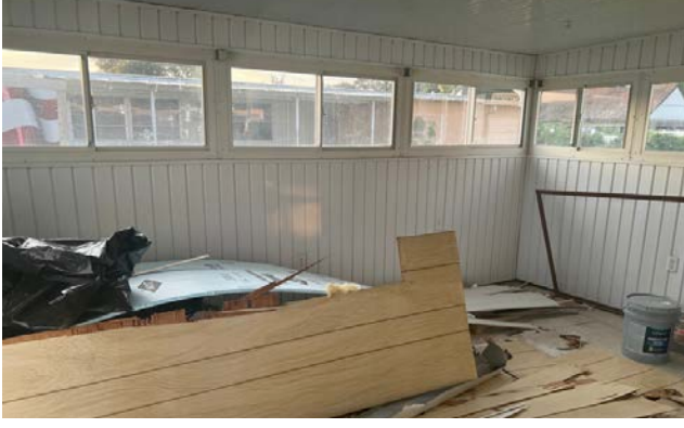
Unit 71 before Our Next Mission started work..