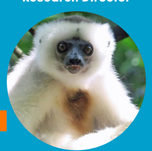
We'll be looking for you!