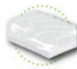
Wood pellet bags