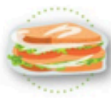
Ziploc & other reclosable food storage bags